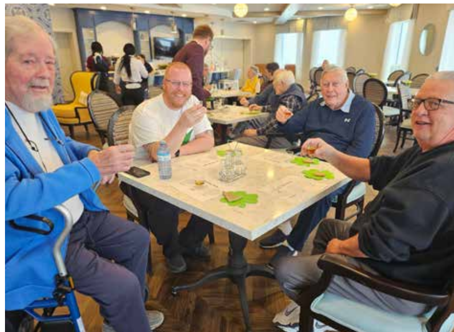
Our Irish Whiskey tasting event was enjoyed by all.