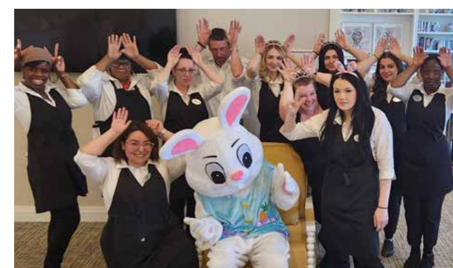
The Easter bunny pays a visit to Community Member and Team Members.